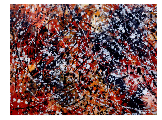
FIGURE 2. (above) IFAR# 13.11, acrylic on cardboard, 22 <sup>3</sup>/<sub>4</sub> x 29 in., purported Pollock, "Brennerman Collection".

FIGURE 3. (right) IFAR# 13.10, acrylic on foam board, 30 <sup>3</sup>/<sub>4</sub> x 27 <sup>3</sup>/<sub>4</sub> in., purported Pollock, "Brennerman Collection".