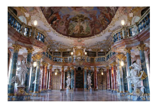
FIGURES 12A and B. A) (left) Photo ostensibly of the library at Buffalo Park; B) (right) Library at Wiblingen Abbey, Ulm, Germany.