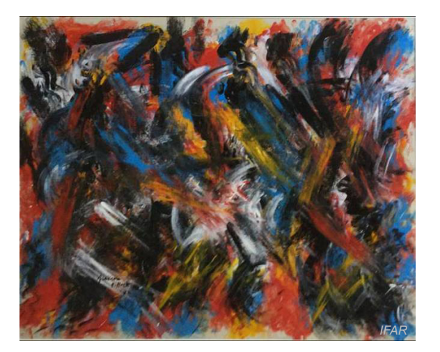
FIGURE 14. IFAR# 15.11, paint on cardboard, 32 x 42 in., purported Pollock "Brennerman Collection".

Our concerns that more fakes from this group would emerge were soon confirmed, as we began getting inquiries from optimistic owners of other Brennerman "Pollocks". One additional Brennerman work was formally submitted to IFAR in 2015. This fourth work, a large abstract painting on cardboard also signed "Jackson Pollock 1942" (FIG. 14), was a brightly-colored brushed composition, with significant passages of finger-painting. Not insignificantly, its dossier was missing some of the very documents