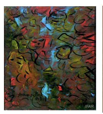
FIGURE 4. IFAR# 13.08 Homage to Gorky , paint on cardboard, 12 x 9 in., purported Pollock, "Brennerman Collection".

Two of the three paintings submitted in 2013 were drip, or poured, works imitative of Pollock's paintings of the late 1940s ( FIGS. 2 & 3 ). Both were signed "Jackson Pollock" and were undated. They featured garish palettes bearing little resemblance to Pollock's palette or works of the period. The third painting ( FIG. 4 ), titled Homage to Gorky on the verso, was a small, brushed — not dripped – quasi-figural work on cardboard, signed and dated "Jackson Pollock '42". Despite their stylistic differences, all three works displayed certain hallmarks of the Brennerman group: