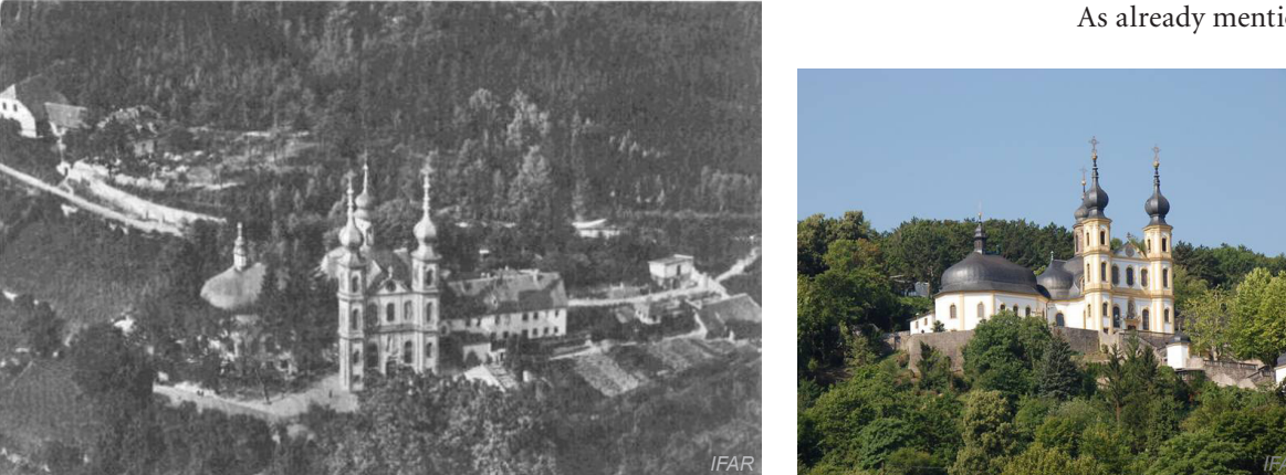
FIGURES 11A and B. A) (left) Photo said to show an overview of Brennerman's Chicago mansion, Buffalo Park; B) (right) View of the Wallfahrtskirche Mariä Heimsuchung (Das Käppele), Wurzburg, Germany.

ostensibly showing the "Southern Entrance" to Brennerman's Chicago mansion actually shows the Sforza Castle in Milan (FIGS. 10 A & B), while a second photo labeled "Over-